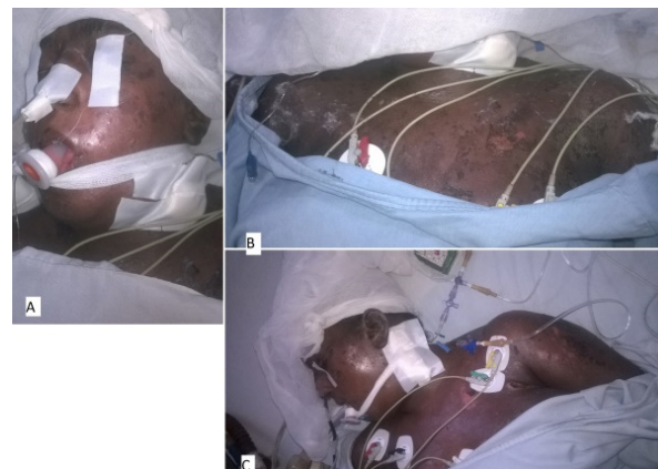
Figure 2. Intubated female for respiratory distress with skin lesions and exfoliation over face, chest and upper limb..