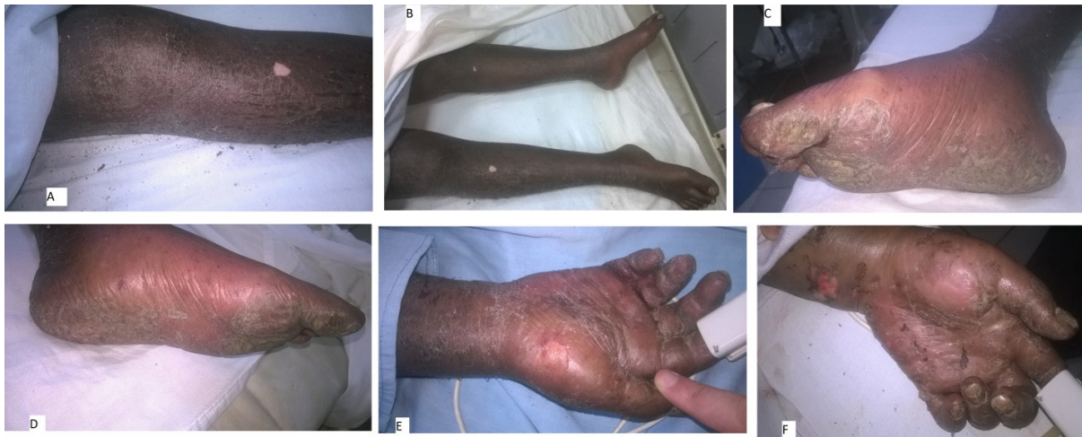
Figure 3. Generalized erythroderma with oedema and scaling, palmar and plantar hyperkeratosis of all limbs.