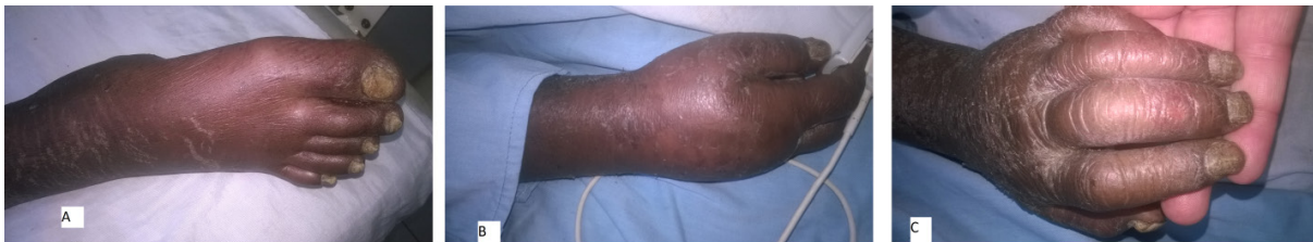
Figure 4. Brittle nails characteristic of sezary syndrome

Aggressive lymphomas are seen more frequently in patients who are HIV-positive, in patients who are on immunosuppressant therapy after organ transplantation or those who have been treated previously for Hodgkin lymphoma or in the presence of inherited immune disorders (14) . In our case no tests were done to find out the possible cause of development of Non-Hodgkin's Lymphoma, but pregnancy itself is a state of immunosuppression.